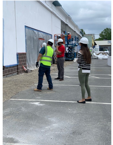
The flock learning everything about EFFIS