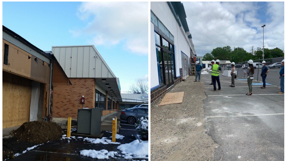
Project Before and After