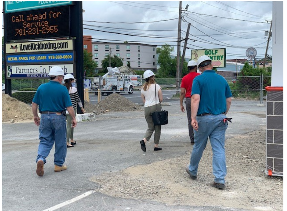
The flock walking 6 ft apart from each other following safety rules