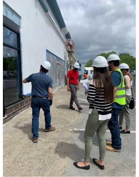
The flock taking notes about the project