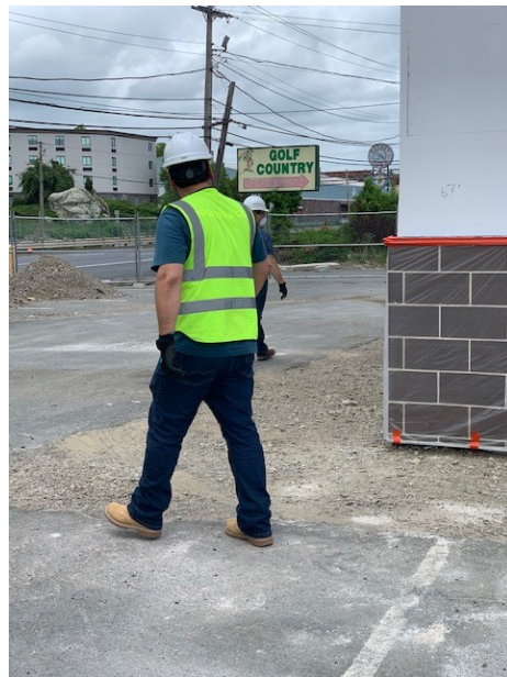
Taking a look at the bricks