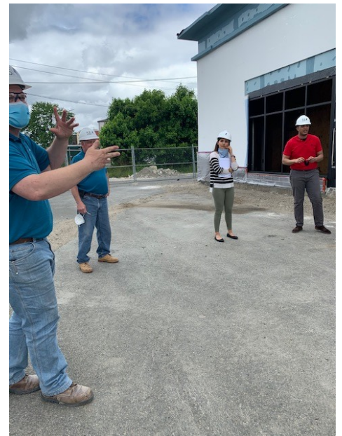
Sharing insights while following safety rules