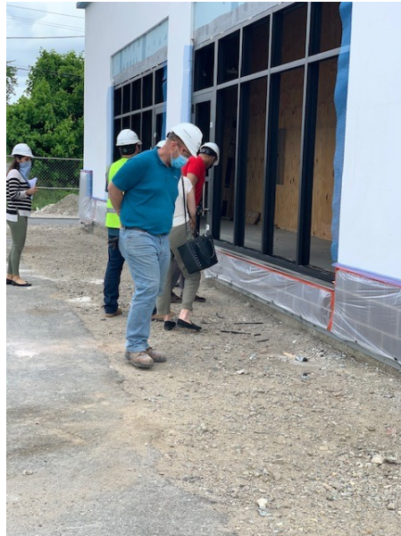
Exploring all the details of the project